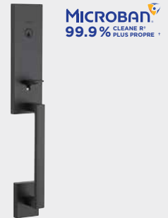
514 | Iron Black