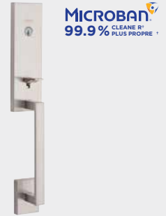
15 | Satin Nickel