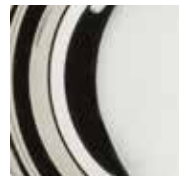
Polished Chrome 26