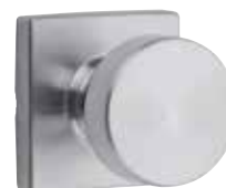
Cambie Knob with square rose