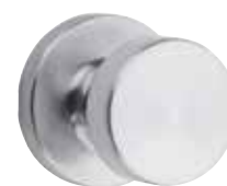
Cambie Knob with round rose